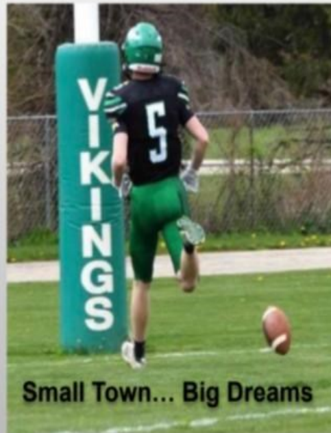
Small Town... Big Dreams